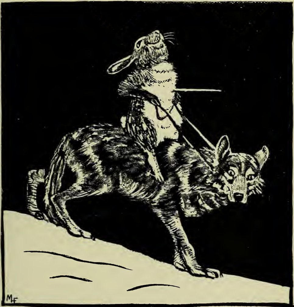
WOLF TROTTED ALONG LIKE A LITTLE HORSE, AND RABBIT LAUGHING TO HIMSELF SITTING IN THE SADDLE